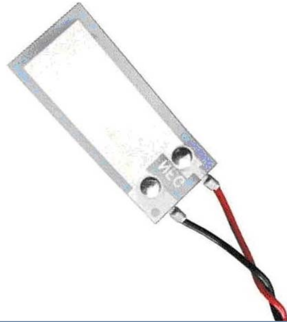
typical piezo properties